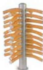
40 port manifold