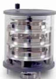
Large capacity chamber