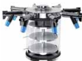
Standard chamber with 8 port manifold