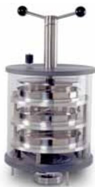
Large capacity stoppering chamber