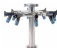
8 port manifold