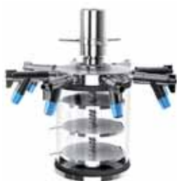
Standard stoppering chamber with 8 port manifold