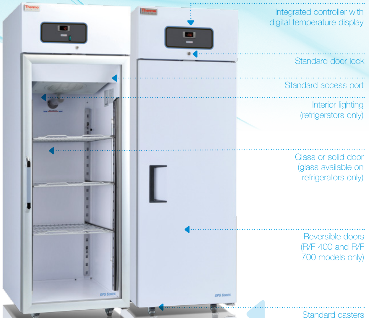
MODEL NO. R700-GAE, 700 litre glass door lab refrigerator. See pages 6-7 for ordering information.